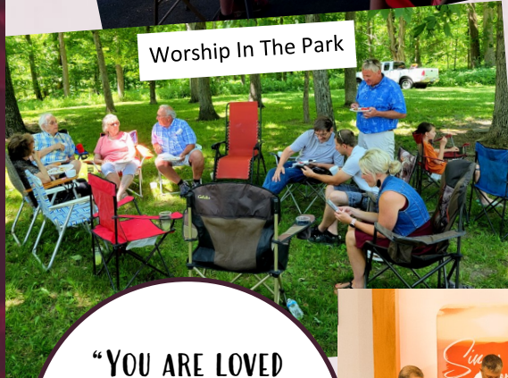
Worship In The Park