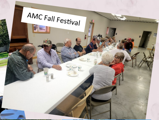
AMC Fall Festival