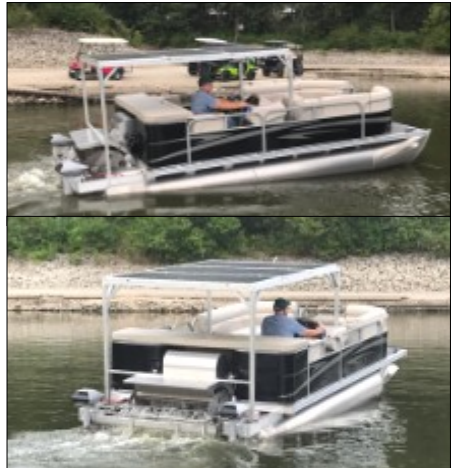
Larry Yoder took his solar powered (all electric) pontoon paddle boat out for its maiden voyage this past week. This is another one of Larry's creative inventions.