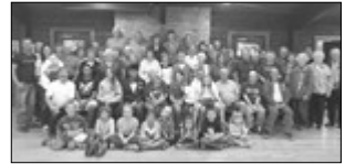
2013 Church Retreat Picture

This is just a reminder to get these dates on your calendar. Sign up for the weekend will begin in March sometime. Families and individuals can go up Friday night and stay through Sunday, drive up Saturday morning, or just come up for the day on the Sunday. We are hopeful that many will join us for both Saturday and Sunday. There will be no church here in Arthur that weekend.