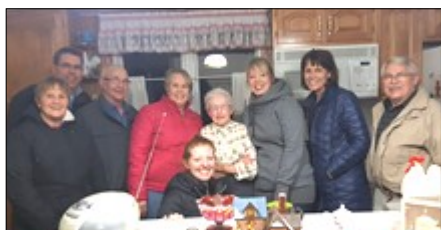
Christmas Caroling last week

High School Winter Retreat ~ Jan. 12-14 Junior High Winter Retreat ~ Jan. 19-21