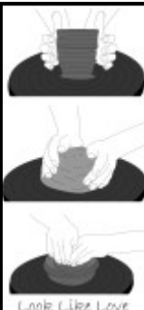
Look Like Love