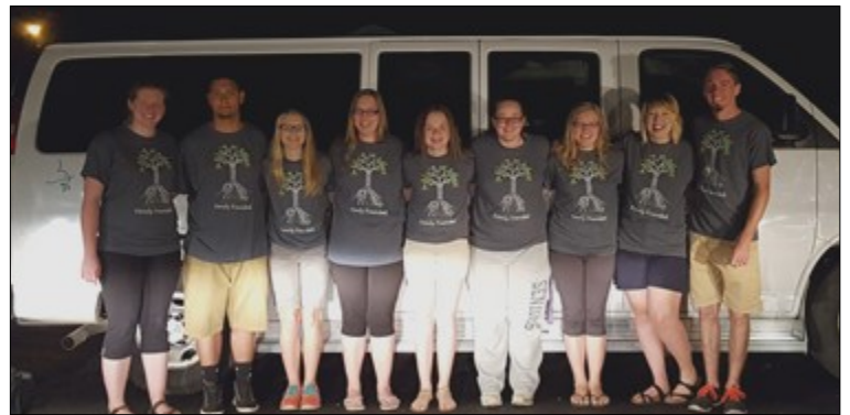
The youth and leaders at 4:30 a.m. Saturday, June 18th in the AMC parking lot getting ready to leave for Denver.